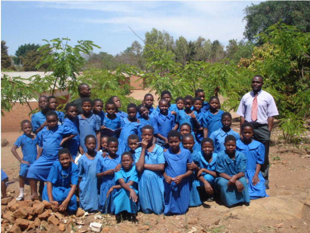
Group photo of a typical club in a girls school.