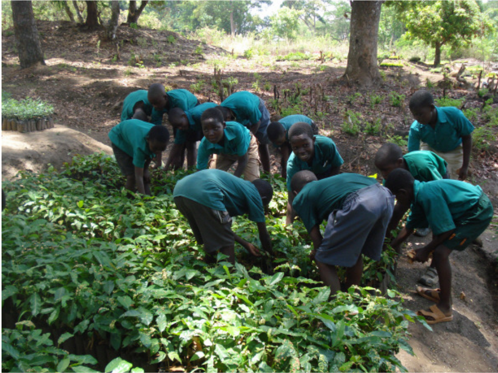
Children weeding the nursery which they have developed themselves of trees to be planted around the school and village to provide more trees for birds.