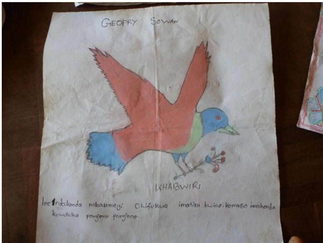
This a turaco which the child likes because it "has beautiful colours, a nice call and it flaps its wings slowly when it flies".