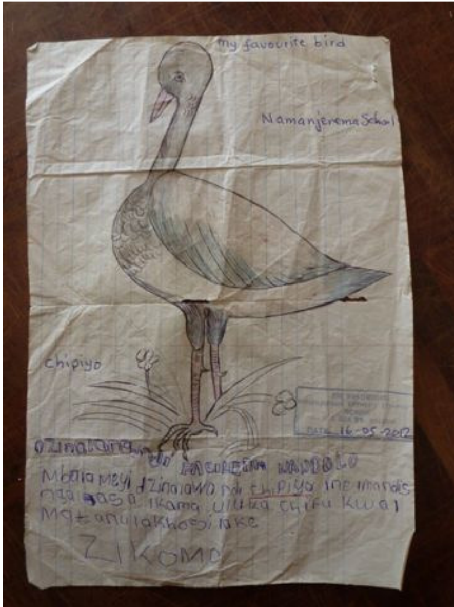
This (which won first prize) is a crane and it is liked because "of the way it stretches out its neck and flies very beautifully".

The individual children received back packs containing varying numbers of exercise books, pens and mathematics sets according to their position which gave great pleasure while the club to which the winning children belonged received a football, once again very highly prized.